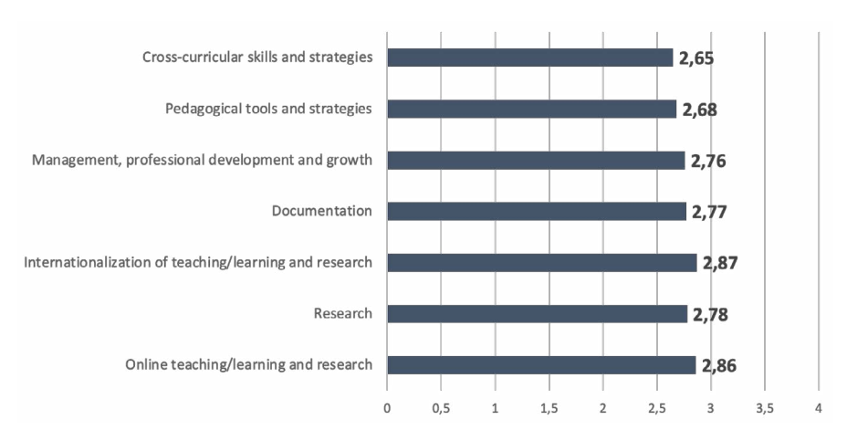
Figure 3. Lecturer ranking of TPD areas